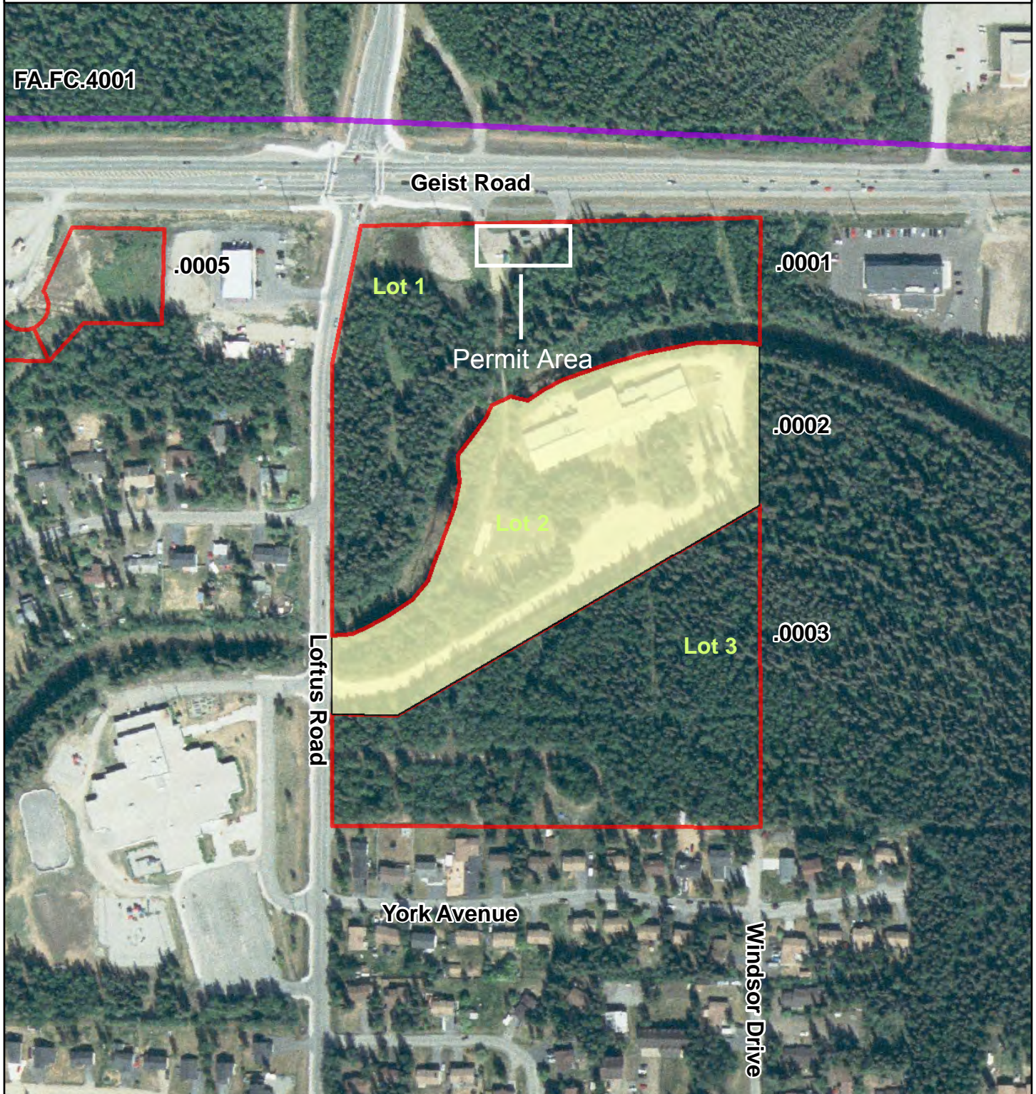
Exhibit A Page 1 of 1