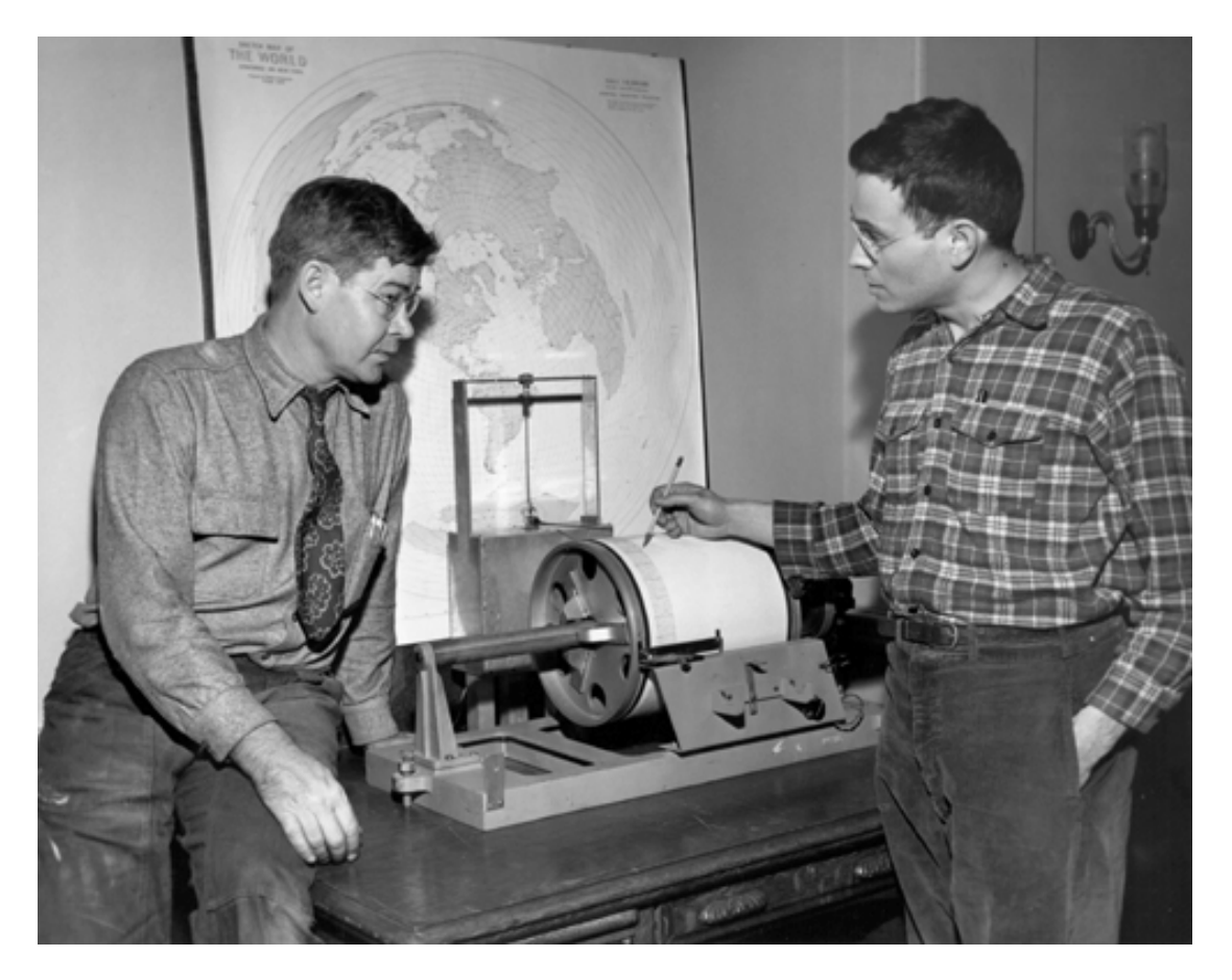
Fig. 1. Maurice Ewing ( left) and Frank Press at the Lamont Geological Observatory, spring 1950, shortly after Ewing's research group moved from Columbia University's Manhattan campus to Palisades, New York.