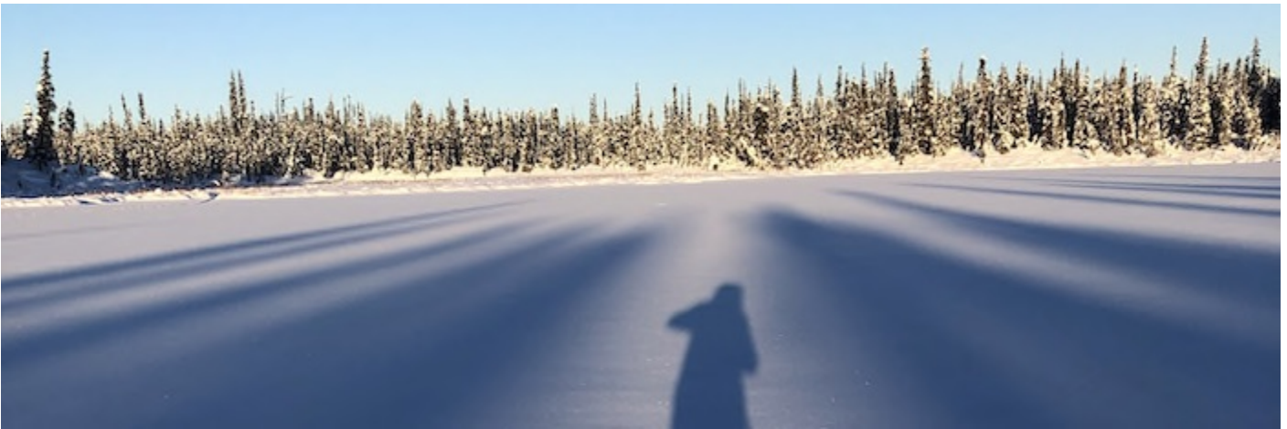
Long shadows on a lake in Fairbanks, late February.