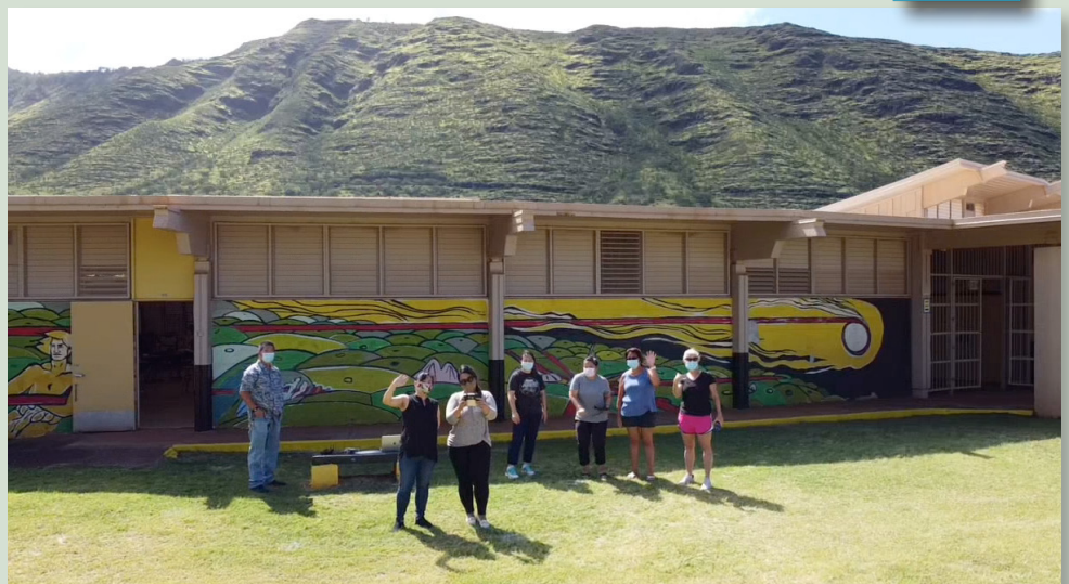
TASK Hawai'i teachers gather for a virtual drone workshop to collaborate with their Nome partners and share aerial views of landscapes, vegetation patterns and habitats.

T his past spring TASK hosted ...continued on page 4