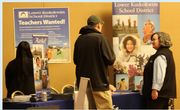
Lower Kuskokwim representatives at a past ATP hosted Job Fair assist potential future personnel with questions about their district.

A TP is active on social media and you may find recent updates there as well. Follow us on Facebook ( facebook.com/AlaskaTeacher ) and Twitter ( UA/