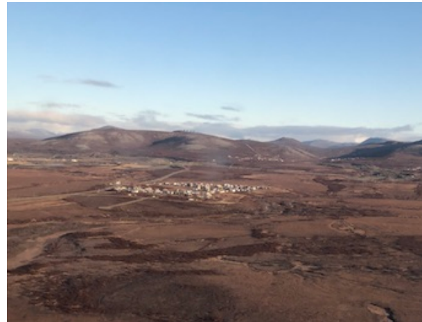
Flying into Nome, in early October.

We are looking forward to an exciting year helping facilitate cultural sharing and learning between our Hawaiian and Alaskan partners.