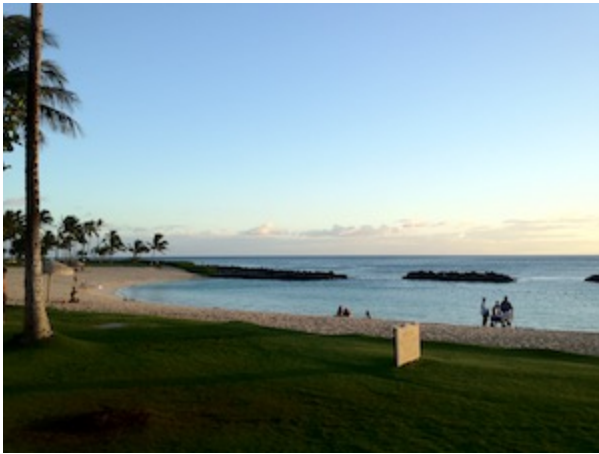
Sunset on a Waikiki beach.

Throughout the year participating teachers will be collaborating online to build place-based culturally relevant STEM lessons. These lessons will focus on virtual education skills and help develop methods for engaging students in their online education yet still utilizing local knowledge and focus on a sense of place.