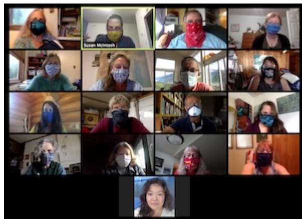
ASMP Mentors and Staff meet on Zoom regularly, sharing knowledge, training, organizational updates, and insights.

Last year, our cadre of 13 mentors served 141 teachers living in 68 communities. We benefited from partnerships with the Department of Education and Early Development (DEED) and eleven districts who were able to cost-share with us. During the last quarter of the school year, our mentors excelled at providing continuous, individual support for teachers during their shift to remote instruction.