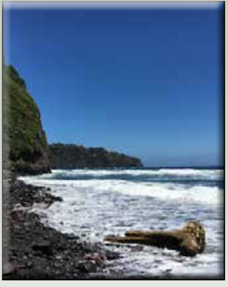
Black sand on this beach in Hawai'i is evidence of old volcanic activity.