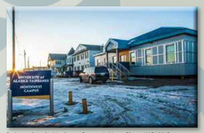
Spring melt at the Northwest Campus in Nome.

ASK participants will then head off to Nome for a taste of rural Alaskan life and learning.