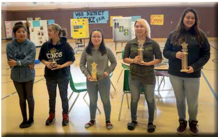
Participants in the District Science Fair, held on March 7th in Stebbins, line up for their awards.