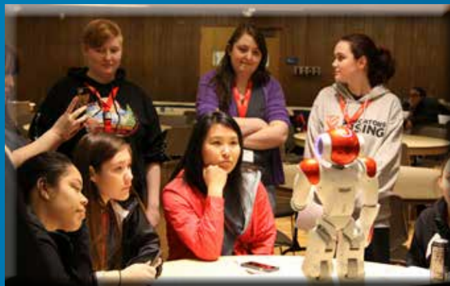
EdRising State Conference participants work together with a robot provided by the School of Education.

E ducators Rising Alaska helps high school students explore careers in teaching. Fewer than half of Alaska's teachers are prepared in-state, so EdRising Alaska gives Alaska high school students ways to explore education careers and provides their mentors with professional development.