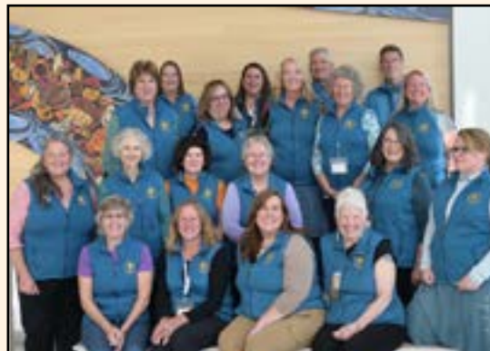
ASMP mentors and staff in Fairbanks for Start Up (training/refresher for new and returning mentors).

T his year we have 15 mentors supporting 135 teachers across Alaska. In addition to supporting early career teachers through the STARR grant, we are supporting as many