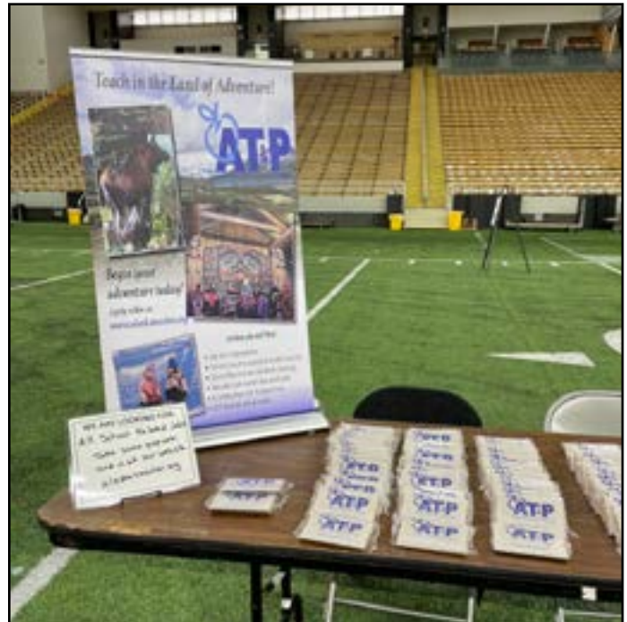
Above: The AT&P table with swag and information about Alaska's different school districts, at the job fair in the University of Idaho, Moscow Kibbie Dome.

For more information about AT&P please visit: www.alaskateacher.org/