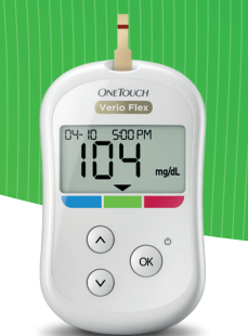
OneTouch Verio Flex® meter

Everyone manages diabetes differently. That is why the OneTouch® brand offers you a variety of features to best fit your lifestyle.