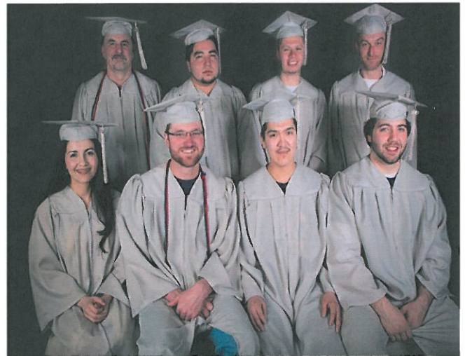
*Path I: Fast Track Carpentry & Weatherization Graduates May 2013