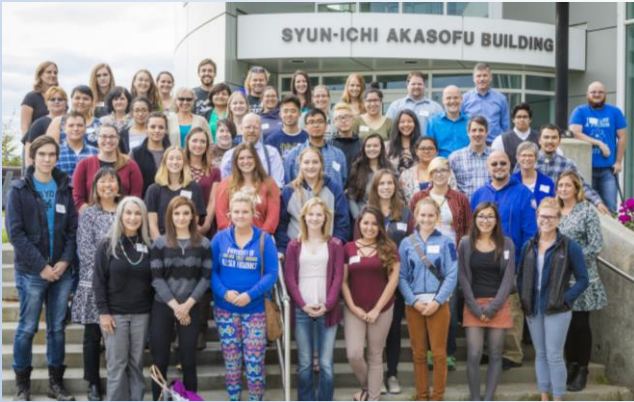
BLaST staff, faculty, GMRA students, UREs & guest speakers Aug. 24 th