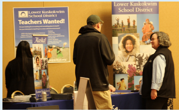
Lower Kuskokwim representatives at a past ATP hosted Job Fair assist potential future personnel with questions about their district.

A TP is active on social media and you may find recent updates there as well. Follow us on Facebook ( facebook.com/AlaskaTeacher ) and Twitter ( UA/