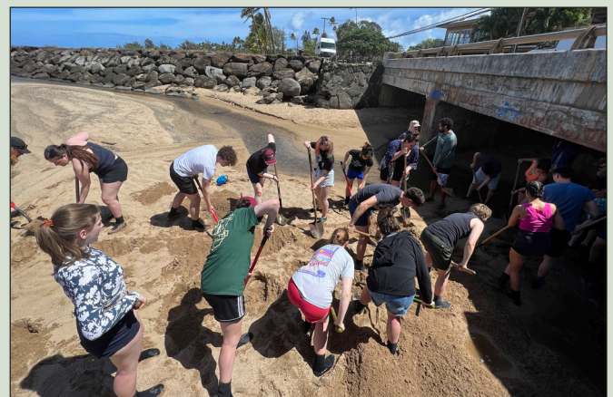
Nome & Wai'anae students , work together to repair a historic fish pond.

I n collaboration with ABR – environmental research & services, TASK developed interactive digital maps using modern satellite imagery from and early aerial photography from the 1950s. Students and teachers will use these interactive maps of Western Oahu and the Nome region to compare community and environmental changes and learn how the landscape has changed and may further change in the future.