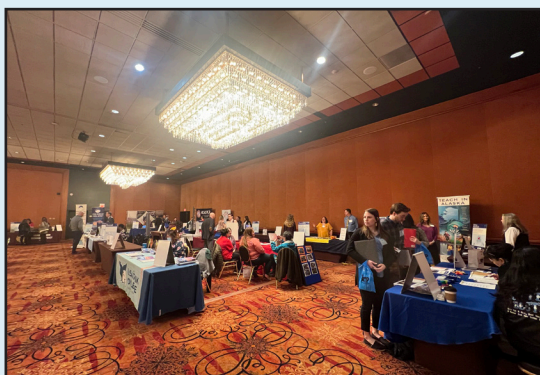
AT&P hosted Job Fair in Anchorage, 2022.

AT&P continues to host the online application and job bank, where candidates apply for jobs and districts reach out to candidates directly. In addition to teacher and administrative positions, AT&P's online job bank (posts or lists) all school related jobs, such as those in the human resources, business, and facilities management offices. Updating "Placement" to Personnel" reflects the work AT&P does for job candidates and school districts. We