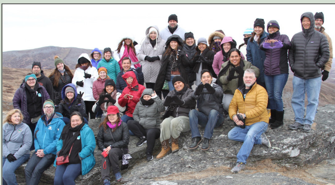
Hawai'i and Alaska teachers gathered in Nome, fall of 2019 to meet their counterparts and for the HI teachers to learn about the local culture, flora and fauna and more.

T eacher Ambassadors Sharing Knowledge (TASK) has completed its four-year program of fostering cultural exchange between Hawaiian and rural Alaskan teachers.