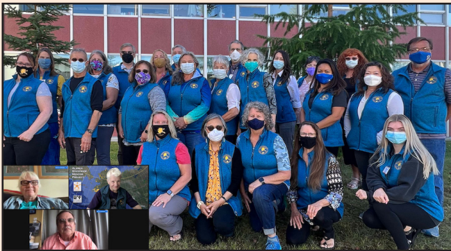
The 2022-23 Mentor Cohort poses with K-12 Staff during Start Up on the UAF campus in August.

The vision of the Alaska Statewide Mentor Project is that every student in Alaska will have the benefit of a great teacher. Our mission is to give new teachers the support they need to succeed. We are thrilled to begin the 22-23 school year with Alaska's districts. Our mentors are passionate about lifting up and supporting the profession of teaching in Alaska. We provide individualized coaching that develops an effective teaching force responsive to the diverse academic needs and cultural backgrounds of all students.