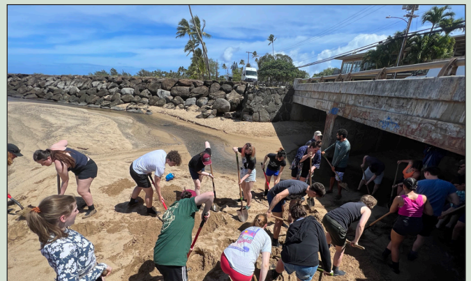
Nome & Wai'anae students, work together to repair a historic fish pond.

T he final TASK workshop brought high school student leaders from the Nome School District to Oahu. Students from Nome met and worked with high school students from Wai'anae, helped repair a historic fish pond and experienced Native Hawaiian cultural traditions.