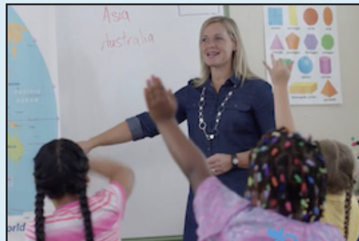
ATP recruited teacher works with her classroom.

ATP has functioned for years as an Education Service Agency (ESA), and with the additional support of being housed under K-12 Outreach, has managed to attain a wider, more effective reach for recruiting candidates, both at the local and national level. Dovetailing with our