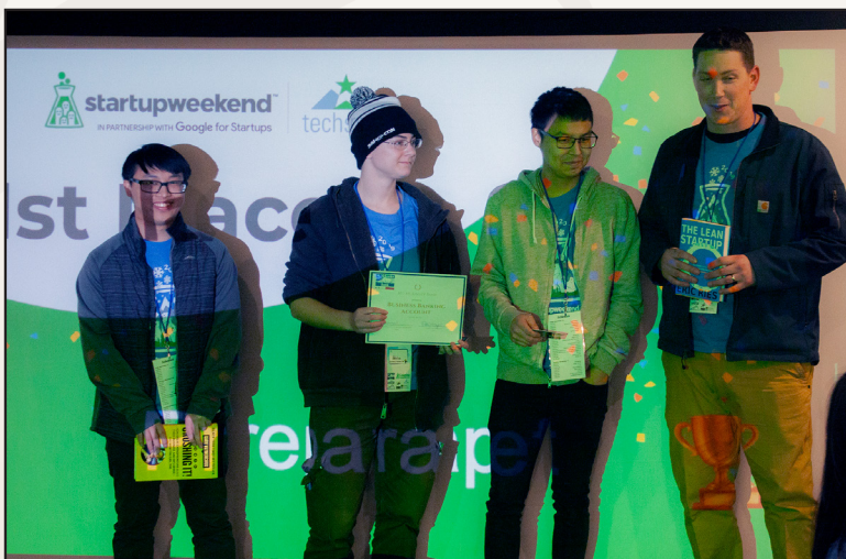
Members of the “Preparapet” team, which took first place at Fairbanks Startup Weekend, held Nov. 15-17, 2019 at the Venue in downtown Fairbanks.

And back in September, Alaska TREND gave out five EPSCoR-funded “Phase 0” awards to Alaskan tech start-ups, for use in applying for larger federal grant support. Second place went to Rhizoform, LLC , which is developing a biodegradable foam derived from fungi for use in shipping seafood, and first place was awarded to The Launch Company , which is developing technology for space launches, including launch sites and fittings for launch vehicles. •