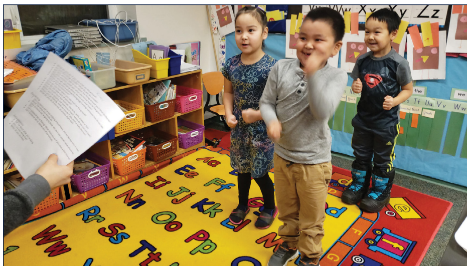
Scammon Bay kindergarten students take part in a playacting exercise as part of the "Children as Cultural Change Agents" course project.