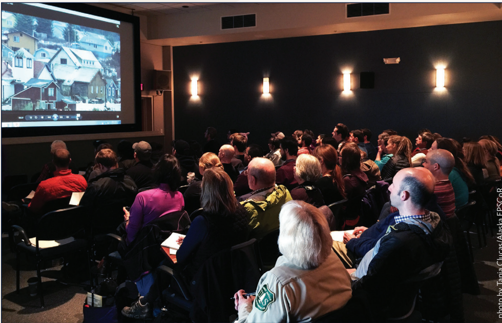
A crowd of Juneau-area tour guides and interpreters take part in the Southeast Test Case's May 2015 Stakeholder Engagement Workshop at the Mendenhall Glacier Visitor Center.