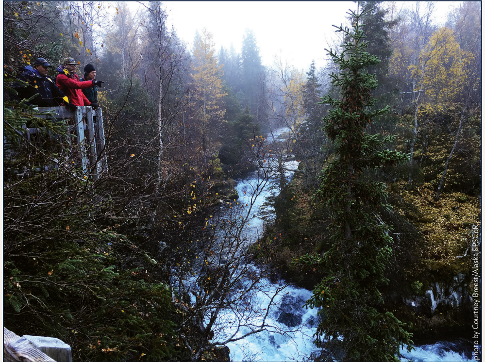
Attendees at the Southcentral Test Case's Adventure Learning Workshop look out over the Russian River.