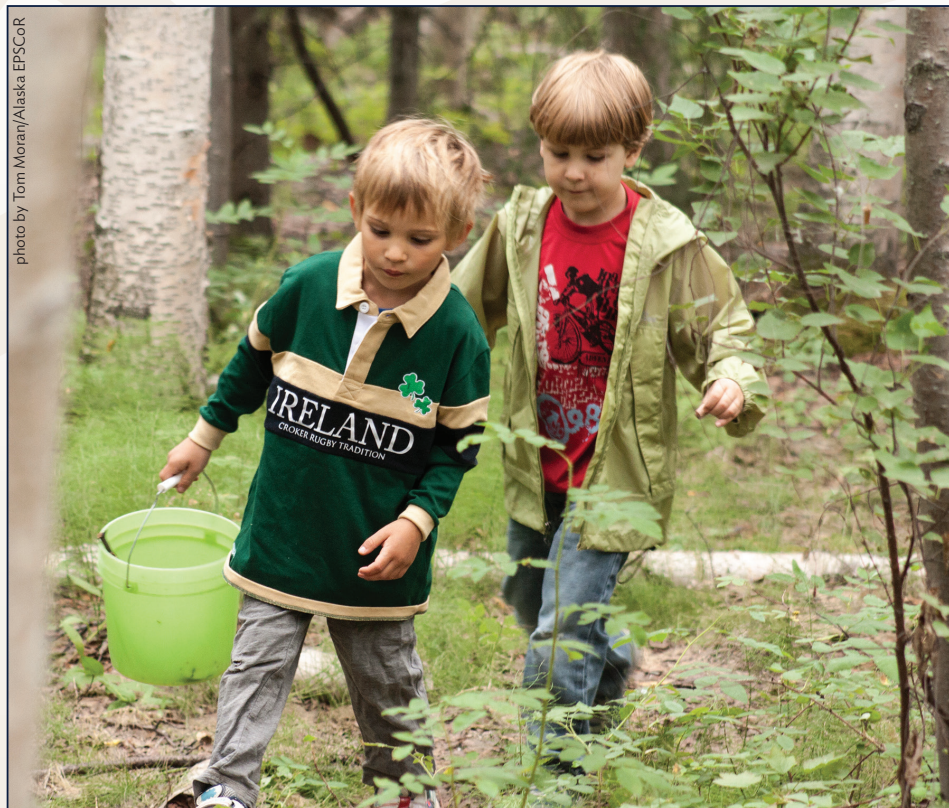
Two children gather materials from a patch of forest on the UAF campus as part of the “Engaging Young Children as Active Researchers” project.

In this case, research began by equipping children with GoPro cameras and observing their interests as they roamed the small forest on the UAF campus. Based on the videos and discussion, the children picked four themes to further explore: rose bushes; “x marks the spot;” forts, castles and houses; and bugs. They then came up with ways they could document their