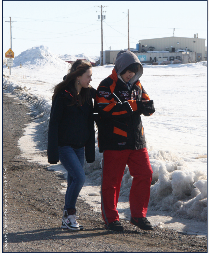
MapTEACH students take part in a GPS activity in Nuiqsut in May 2014.

"They went from learning how to collect data, to learning how to enter data that they collected, and then progressed to entering data that others collected," Butcher noted.