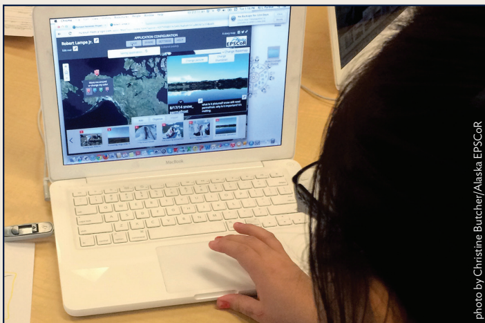
A MapTEACH student builds an online Story Map in October 2015.