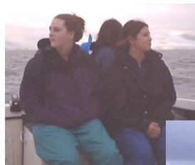
Looking for humpbacks