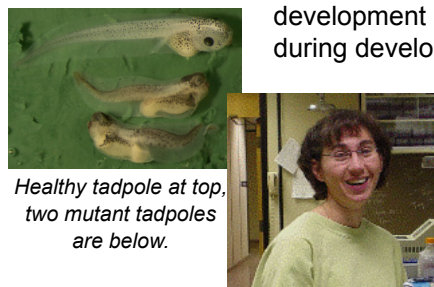
Healthy tadpole at top, two mutant tadpoles are below.