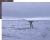
Whale fluke.