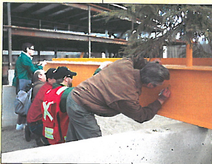
UAA celebrated the final piece of steel hoisted into place on the Alaska Airlines Center May 10.