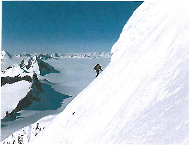
Alex Botelho climbing on the north face of Rhino Peak.