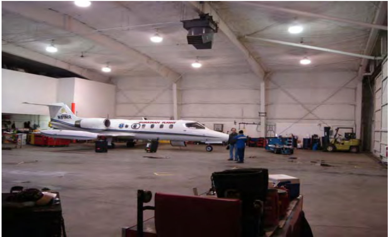
HANGER INTERIOR - FINISHED SPACE LOCATED BEHIND WHITE WALL