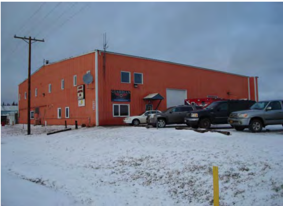
HANGER BUILDING LOOKING NORTH FROM AEROFUEL PLACE