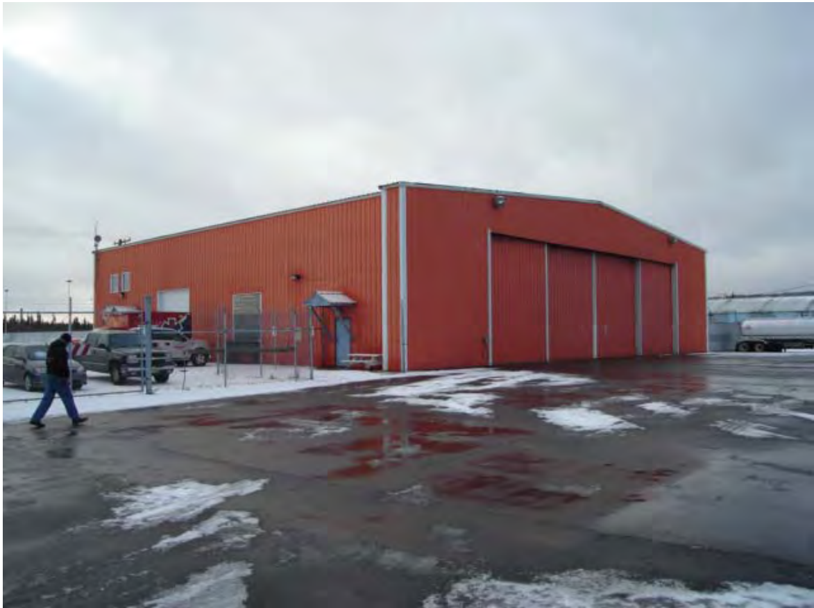
HANGER BUILDING LOOKING WEST FROM RAMP AREA