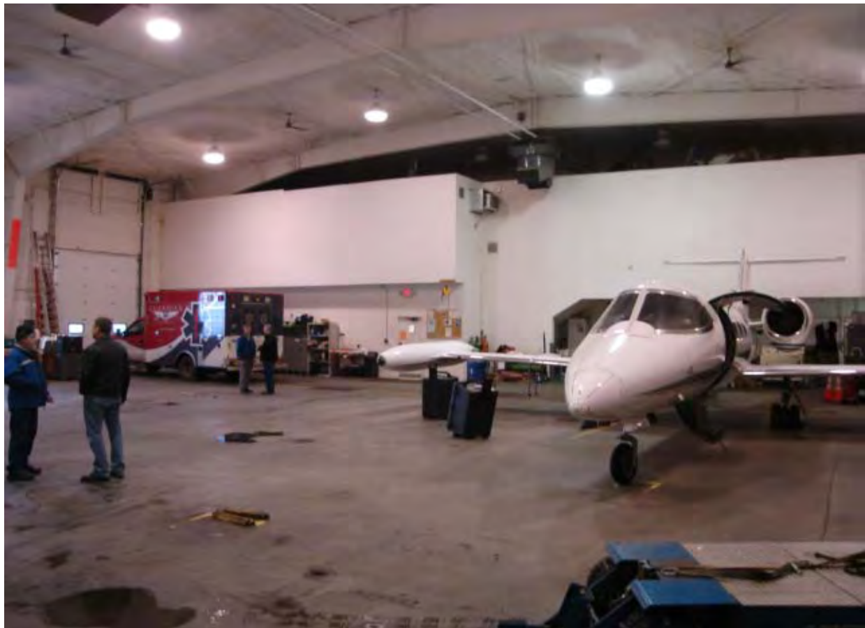
HANGER INTERIOR - FINISHED SPACE LOCATED BEHIND WHITE WALL